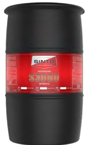
S3000 SEMI-PERMANENT PROTECTION 1 TO 3 YEARS