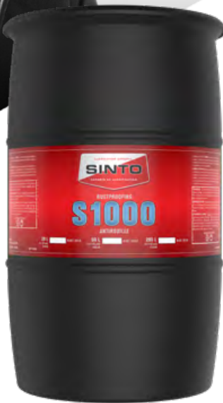
S1000 ANNUAL PROTECTION